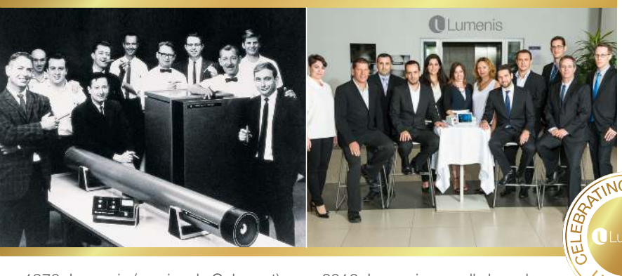
1970: Lumenis (previously Coherent) introduces the first argon laser photocoagulator in ophthalmology.

2016: Lumenis proudly launches the new retinal care portfolio, starring the Smart 532<sup>™</sup>, green photocoagulator with SmartPulse<sup>™</sup>.